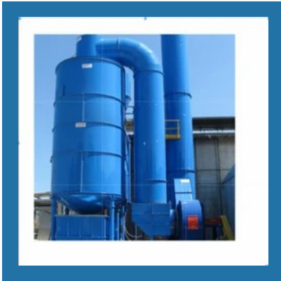
Wet Scubber .