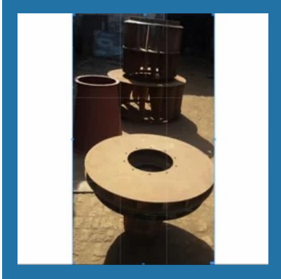
Back Ward Curved Impeller