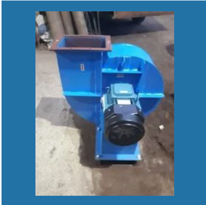
Direct Drive Blower