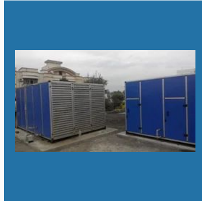
Air Cooling Systems