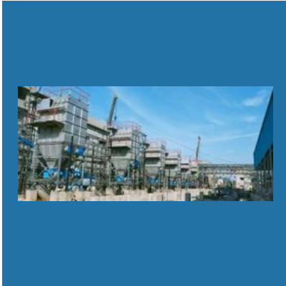
Industrial Dust Extraction System