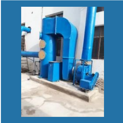
Pp Frp Scrubber System