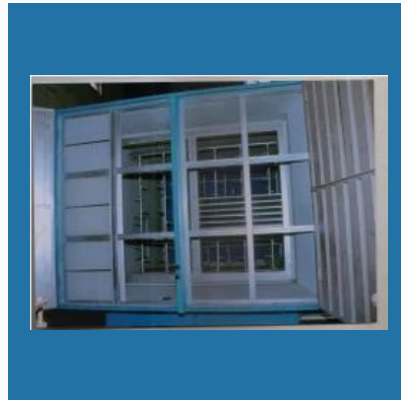
Air Cooling Spray Type Cabinet