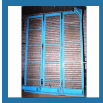
Auto Viscous Filters