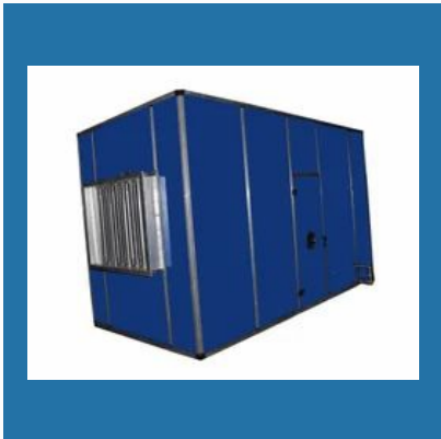
Air Washer Equipments