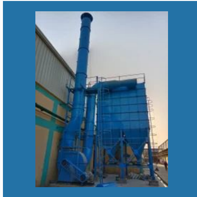
Pulse Jet Type Dust Collector