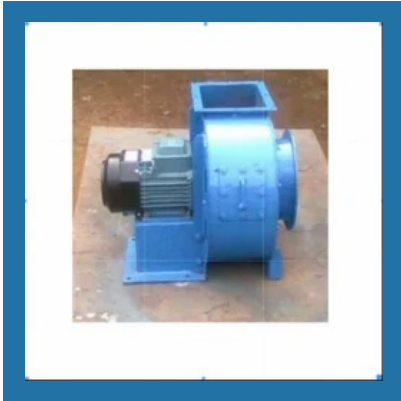
Paint Booth Blower