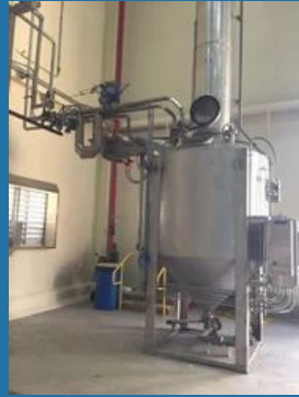
Air Pollution Control Equipment