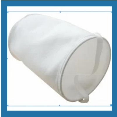
Dust Collector Bags