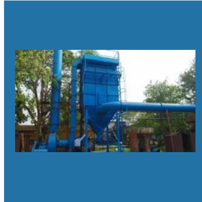
Pulse Jet Bag Filters