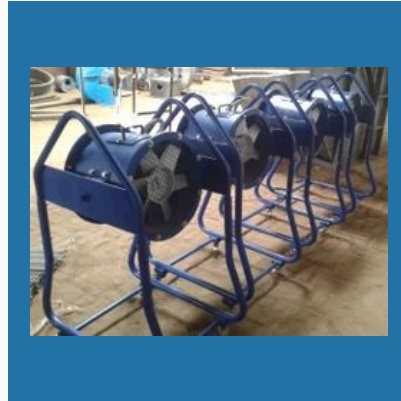
Stand Mounted Axial Fan