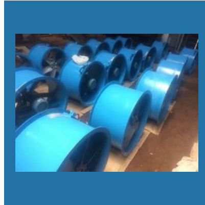
Industrial Axial Flow Fans