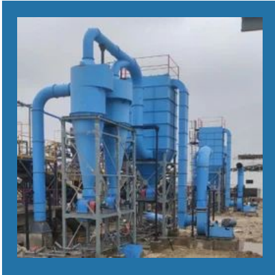
Cyclone Dust Collector