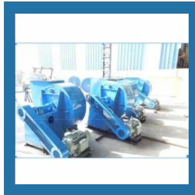
Belt Drive Centrifugal Blower