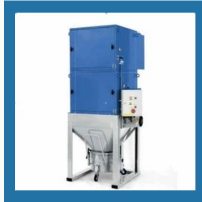
Dust Extraction Systems