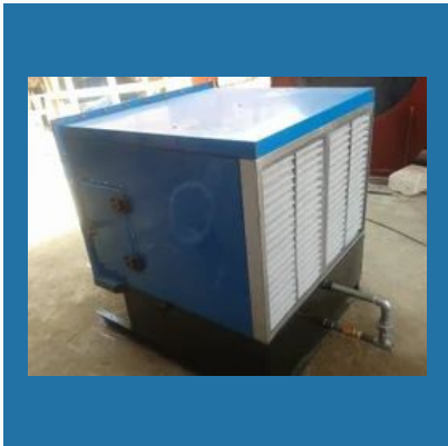
Industrial Air Cooling Unit