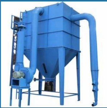
Industrial Dust Collector