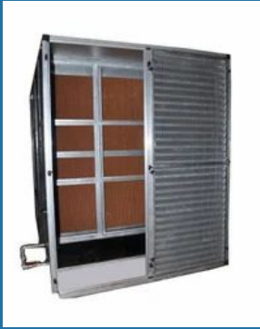
Evaporative Air Washer