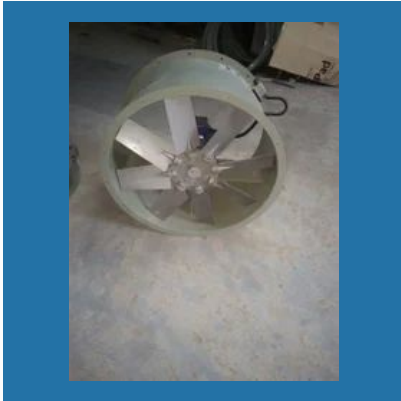
Suction Axial Flow Fan