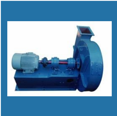
Coupling Drive Centrifugal Blower