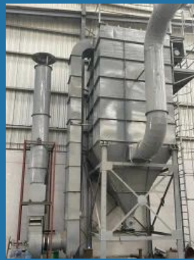
Pulse Jet Dust Collector