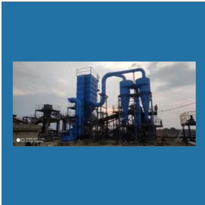
Dust Extraction System for Boiler