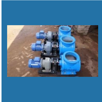
Airlock Valve .