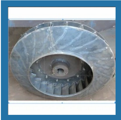
Dust Impeller .