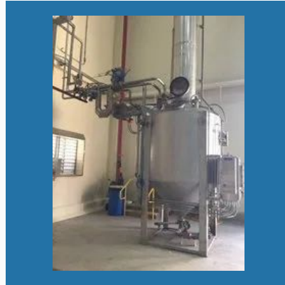
Fume Scrubber System