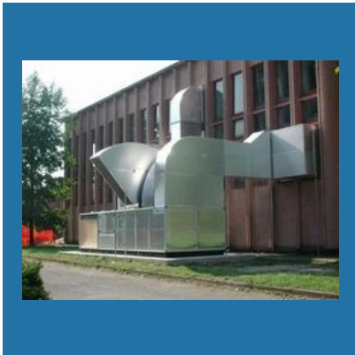
Duct Air Washer